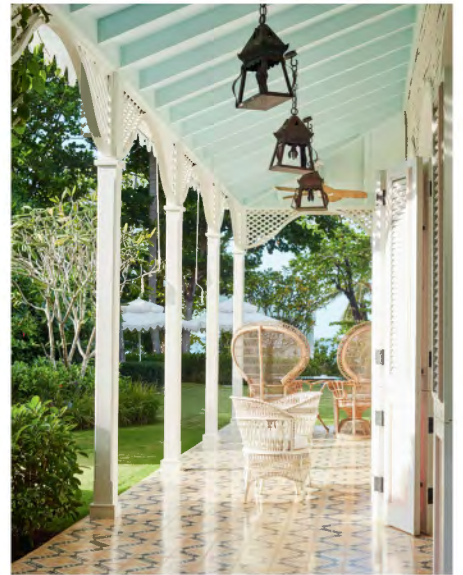
Opposite: The pool sits centre stage and overlooks Playa Grande beach. This page all pictures: Every room in all of the nine residences and public areas is different, and each is painted in what Celerie calls, 'faded bathing-suit colours', and layered with art, objects and vintage furnishings. The porches and verandas are designed to feel like outdoor living areas, and every residence has a hammock on its porch (top centre). One of the changing rooms beside the pool (bottom left)