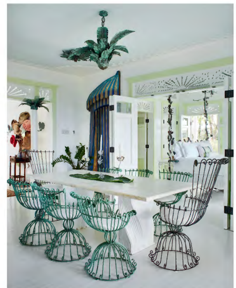
This page from top: The children’s bedroom in Casa Guava, one of the houses for rent, which is Celerie and Boykin’s own beach house. All the bathrooms are fitted with oversize copper baths. Casa Guava is full of quirky touches, such as the garden furniture used in the dining area. Opposite: The Great Room in the main Clubhouse